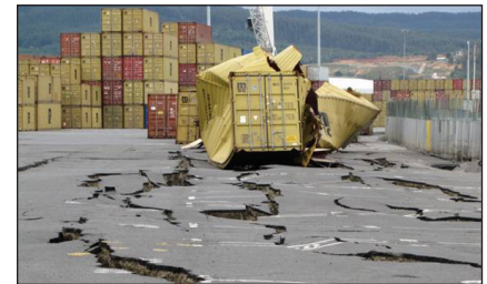
Port of Coronel, Chile, 2010.

Across the range of earthquake professions, this seminar will provide an in-depth understanding of the major lessons from these events. No matter your disciplinary specialty, you will leave this program having gained both a broader and deeper understanding of these once-in-a-generation earthquakes, and with valuable lessons useful in your practice. 6 Professional Development Hours available.