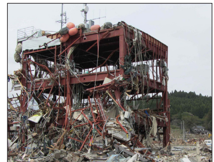
Damage from 2011 Tohoku, Japan, tsunami.

Wednesday, October 24: Salt Lake City, Utah Thursday, October 25: Los Angeles, California Monday, October 29: San Francisco, California Tuesday, October 30: Seattle, Washington