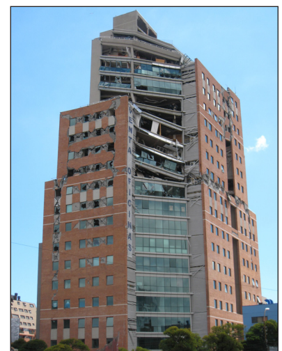
Partial collapses in an RC-wall building in Concepción, Chile, 2010.