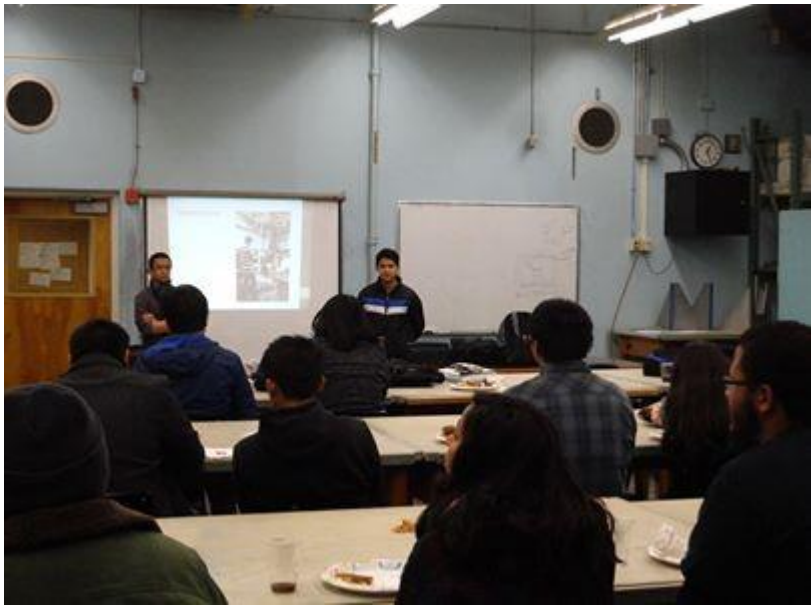
Figure 1: Sokniron and Alronil giving their NEES/PEER presentation at our first general meeting