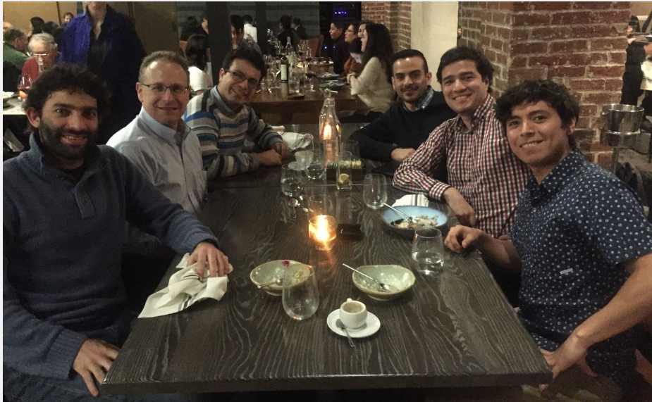
Dinner at Vino Enoteca.